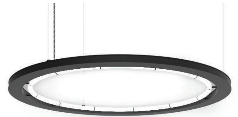
TOKYO S height 30 mm | diameter 1000 mm LED source - 20W - dimmable