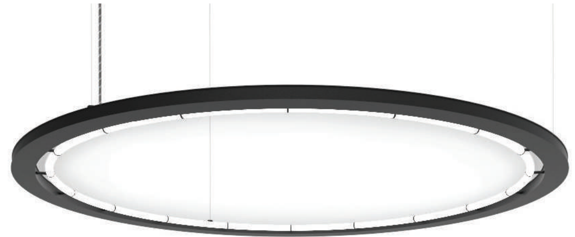
TOKYO M height 30 mm | diameter 1500 mm LED source - 30W - dimmable