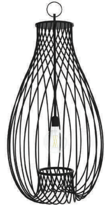
Pirouette II height 1000 mm | diameter 540 mm weight 8kg