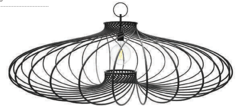
Pirouette IV height 450 mm | diameter 1200 mm weight 11kg