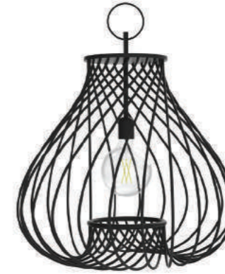
Pirouette III height 550 mm | diameter 540 mm weight 5kg