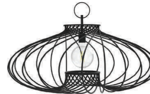
Pirouette I height 400 mm | diameter 800 mm weight 7kg