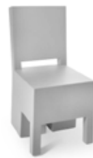
male chair #3