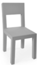
male chair #1