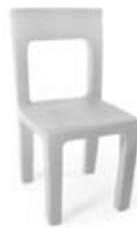
female chair #1