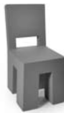
male chair #2