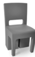
female chair #2