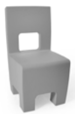
female chair #3